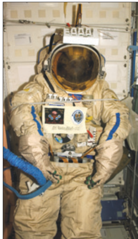
SuitSat-1 all dressed up for its flight into space.

ARISSat-1 is a unique Amateur Radio experiment and offers many new and exciting features. Among them, the on-board SDX system allows hams to speak with one another via satellite using CW and SSB. And unlike FM repeater satellites that can only support one conversation at a time, the